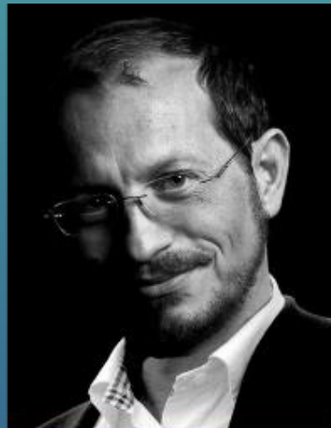
Maurizio Carta Deputy Mayor for urban regeneration, Municipality of Palermo, Italy