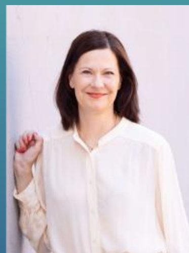
Minna Arve Mayor of Turku, Finland