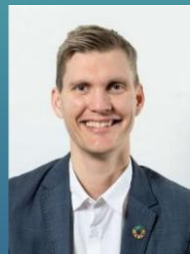
Lasse Frimand Jensen Mayor of Aalborg, Denmark