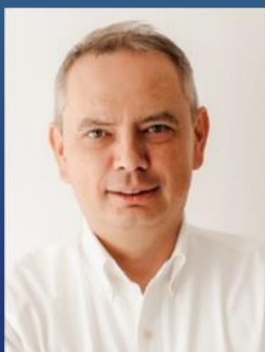
Wojciech Deska European Investment Bank