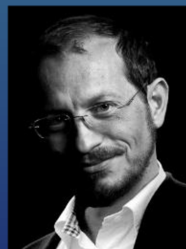
Maurizio Carta Deputy Mayor for urban regeneration, Municipality of Palermo, Italy