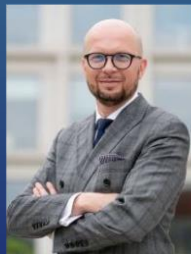
Jakub Mazur First Deputy Mayor of Wrocław, Poland