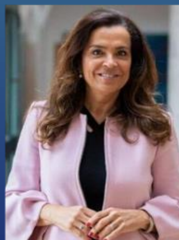
Luísa Maria Neves Salgueiro Mayor, City of Matosinhos, Portugal, ICLEI European Regional Executive Committee