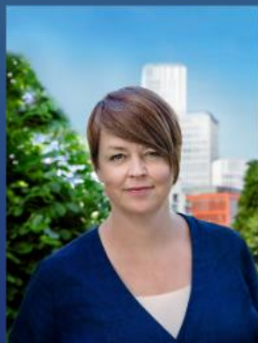
Mayor Katrin Stjernfeldt Jammeh Mayor of Malmö, Sweden, President of ICLEI