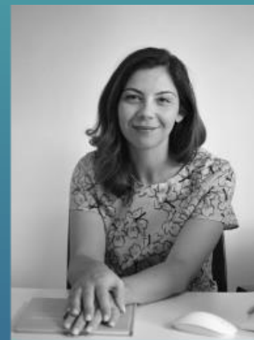
Frida Pashako Deputy Mayor of Tirana, Albania