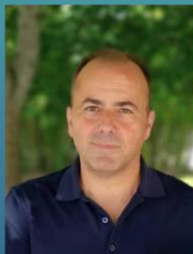
Aitor Zulueta Director of the Environmental Studies Centre, Vitoria-Gasteiz City Council, Spain