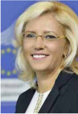
Corina Crețu Commissioner Regional Policy European Commission