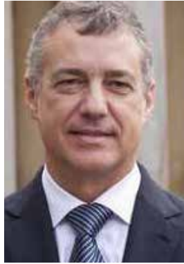
Iñigo Urkullu Lehendakari (President of the Basque Government) Basque Country